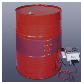
Drum heating mat KM-HMD-200