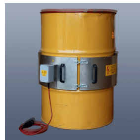
Drum strip heater KM-HSD-200