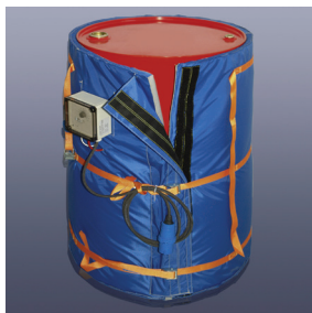
Drum heating jackets KM-HJD-250S