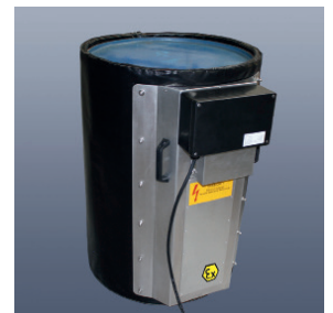
Ex-drum heating jacket series KM-HJD-200-Ex

SAF Wärmetechnik GmbH Weinheimer Str. 2a D-69509 Mörlenbach